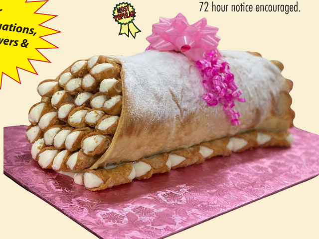
(72 hour notice encouraged)