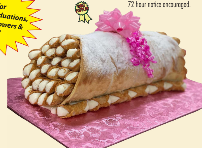
(72 hour notice encouraged)