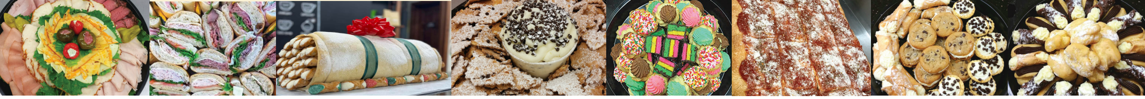
Boar's Head Tray Sandwich Platter Big Cannoli Cannoli Chip & Dip Cookie Tray Sicilian Pizza Cannoli 3-Way Pastry Tray